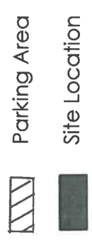
Project Site Location Map